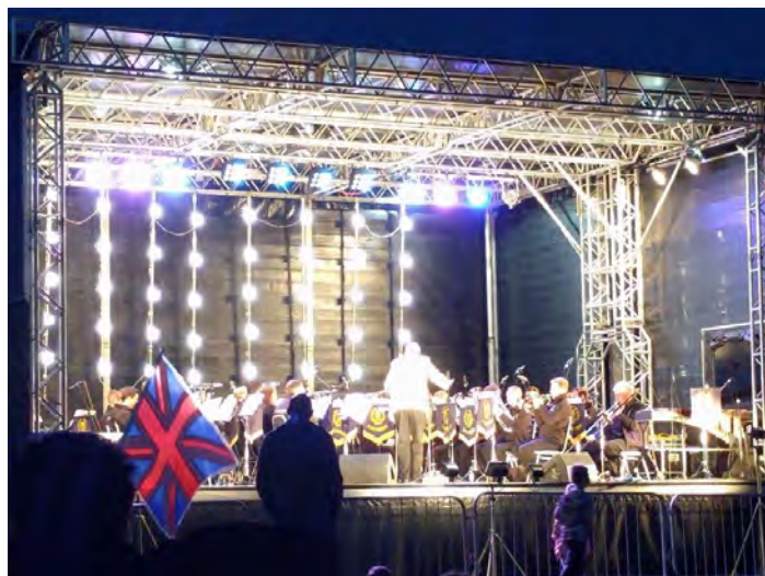
What a stage! The Band at the Birstall Proms Concert