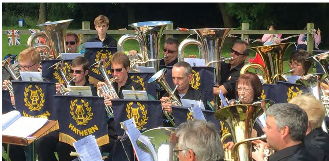
At the Queen's Birthday Celebration at Cossington in 2016.