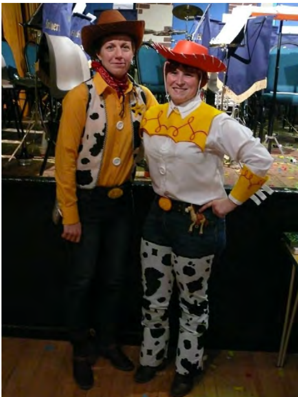
As Toy Story characters for a Music from the Films Concert Brass concert