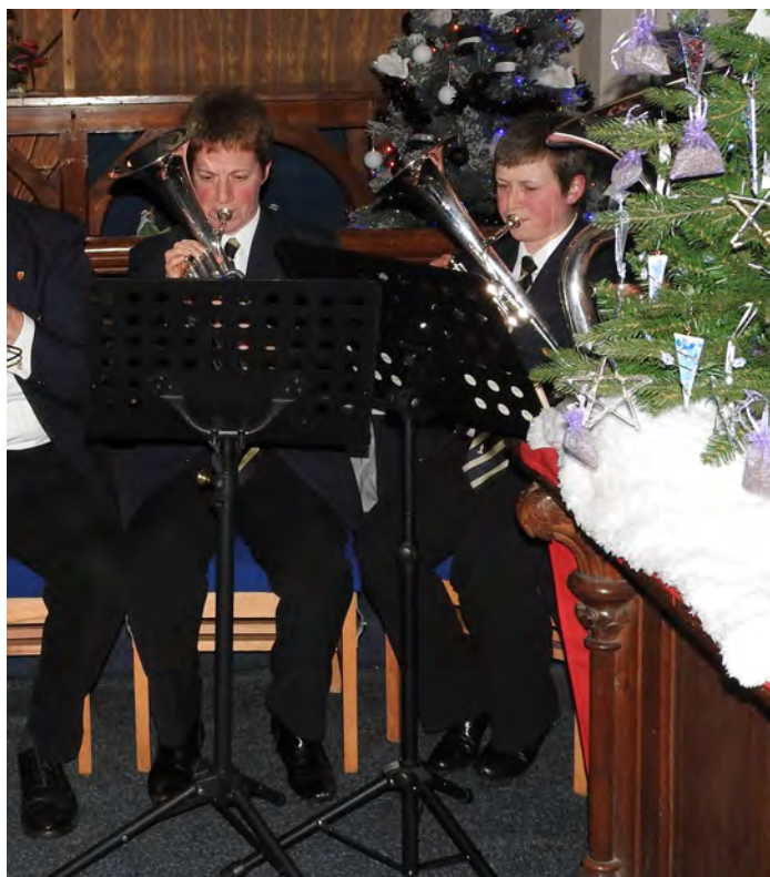
At Hathern's Christmas Tree Festival