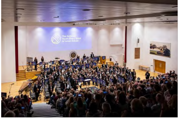
The full band on stage at the final concert.