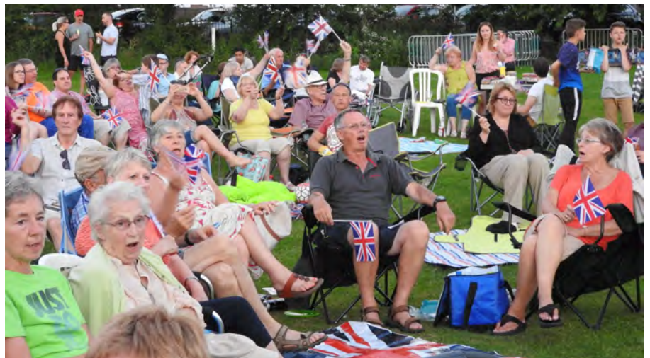
We sang and waved our flags