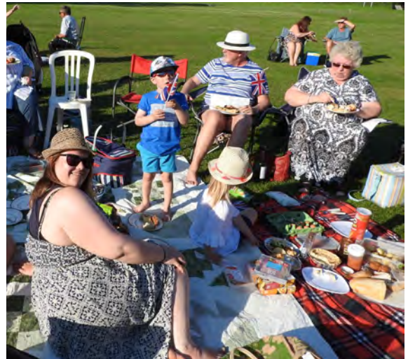
We enjoyed our picnic