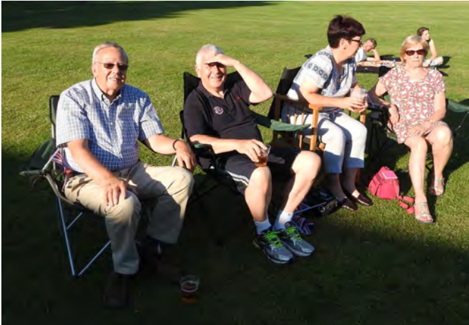
We took some refreshment