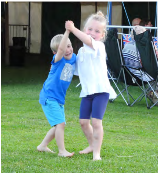
We danced to the music