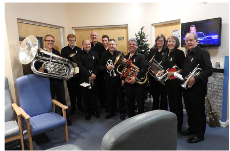
The Band at Loughborough Hospital