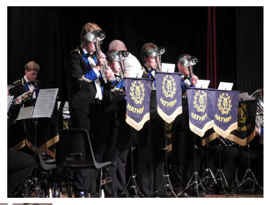
Great applause for our brilliant Training Band

"It's the Most Wonderful Time of the Year" featuring the Horn Section