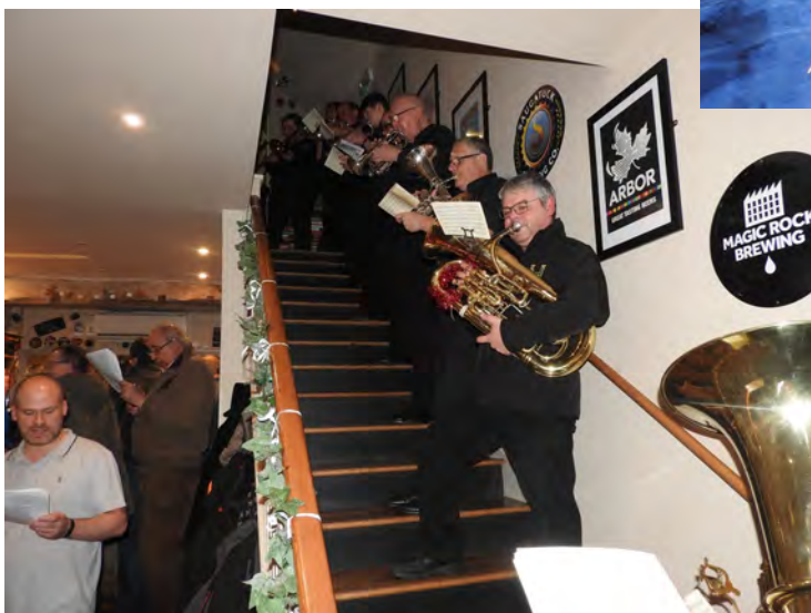
Customers were in great voice singing carols at the Needle and Pin micropub