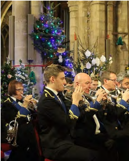
The Senior Band played at the regular concert at Melton Christmas Tree Festival