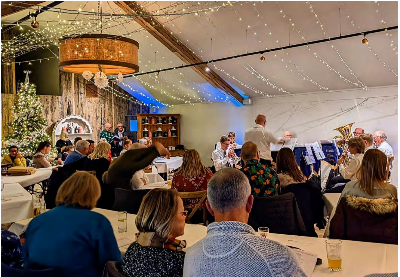
Concert Brass entertained at the Manor House Hotel, Quorn on 12 December.