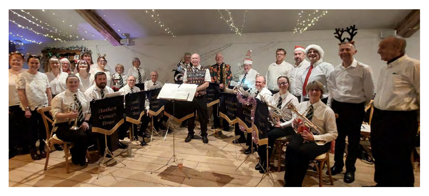
Youth and Concert Brass played at the Manor House at Quorn